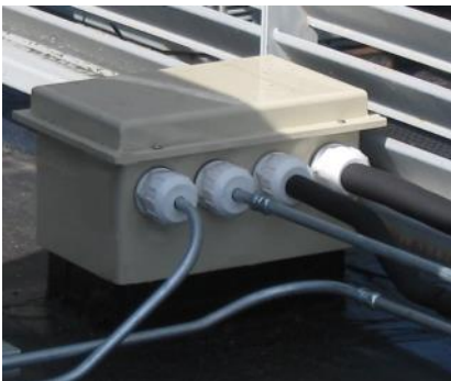
"Small" Pipe Chase Housing With 4 Sigrist Exit Seals® installed

Locate the machine stamped "Starter Dimples" on the front or rear face of the Pipe Chase Housing. Then, using a metal cutting hole saw (or punch), drill a 2 1/4" Diameter hole at the desired location. Clean burrs off the inside and outside of the fresh cut. Remove the Exit Seal backing nut then insert the Sigrist Exit Seal® from the outside of the Housing unit. Re-thread the Exit Seal backing nut back onto the body of the Exit Seal from the inside of the housing—use a strong "hand tight". Do not over tighten with a wrench.