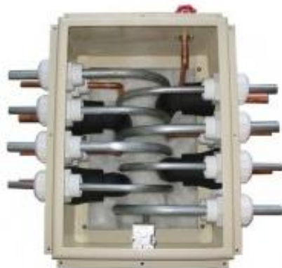
Top view of the "Medium" Pipe Chase Housing with the lid removed with 16 Sigrist Exit Seals® installed. (Contractor installed hose bibb and power)